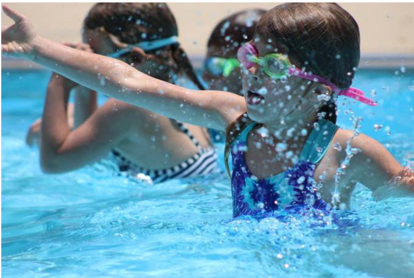
Splashing around the pool on the 2016 season opener of the Lake Forest Club

Many North Shore pools, beaches and water sports venues are opening over Memorial Day Weekend. It's the perfect time of year to grab your suit and towel and enjoy the water, whether its beach or pool or slide. Have a lovely holiday weekend and remember to be safe!