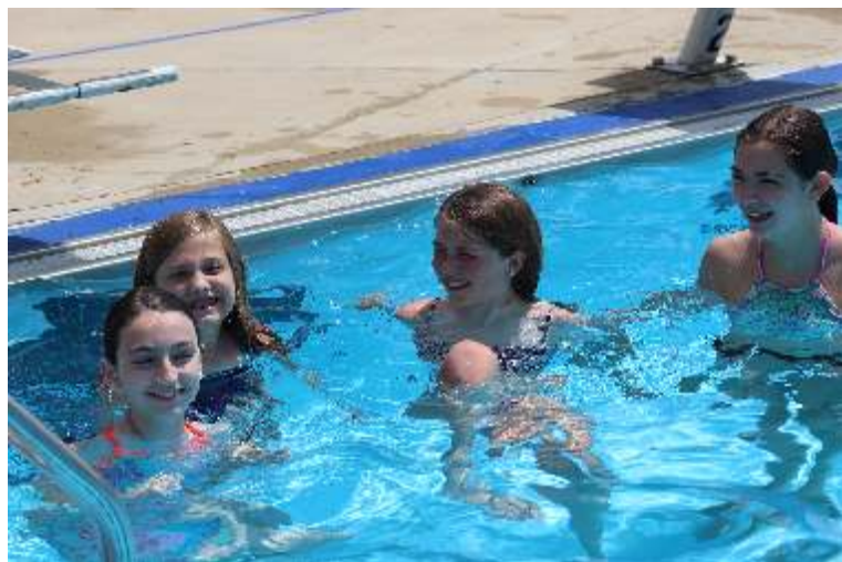
Blue sky and water...

Friday, May 27, was the first day of swimming at The Lake Forest Club, a private club that features a 5-meter lap pool, deep diving pool, and shallow pool for younger children and is located at 554 N. Westmoreland, Lake Forest, (847) 420-0082, www.lakeforestclubfamily.com .